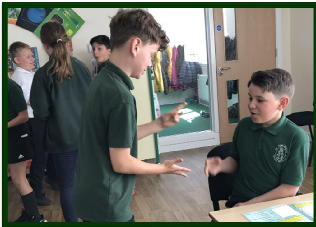
LEARN, GROW & FLOURISH